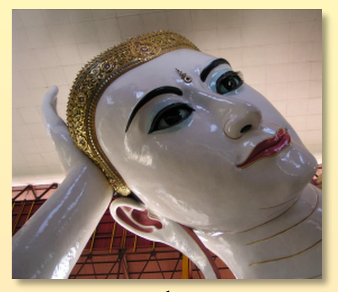
by Bhikkhu Pesala